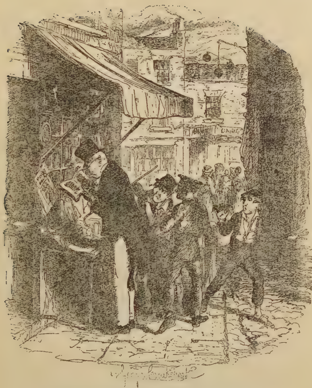
CLIVER AMAZED AT THE DODGER'S MODE OF GOING TO WORK.